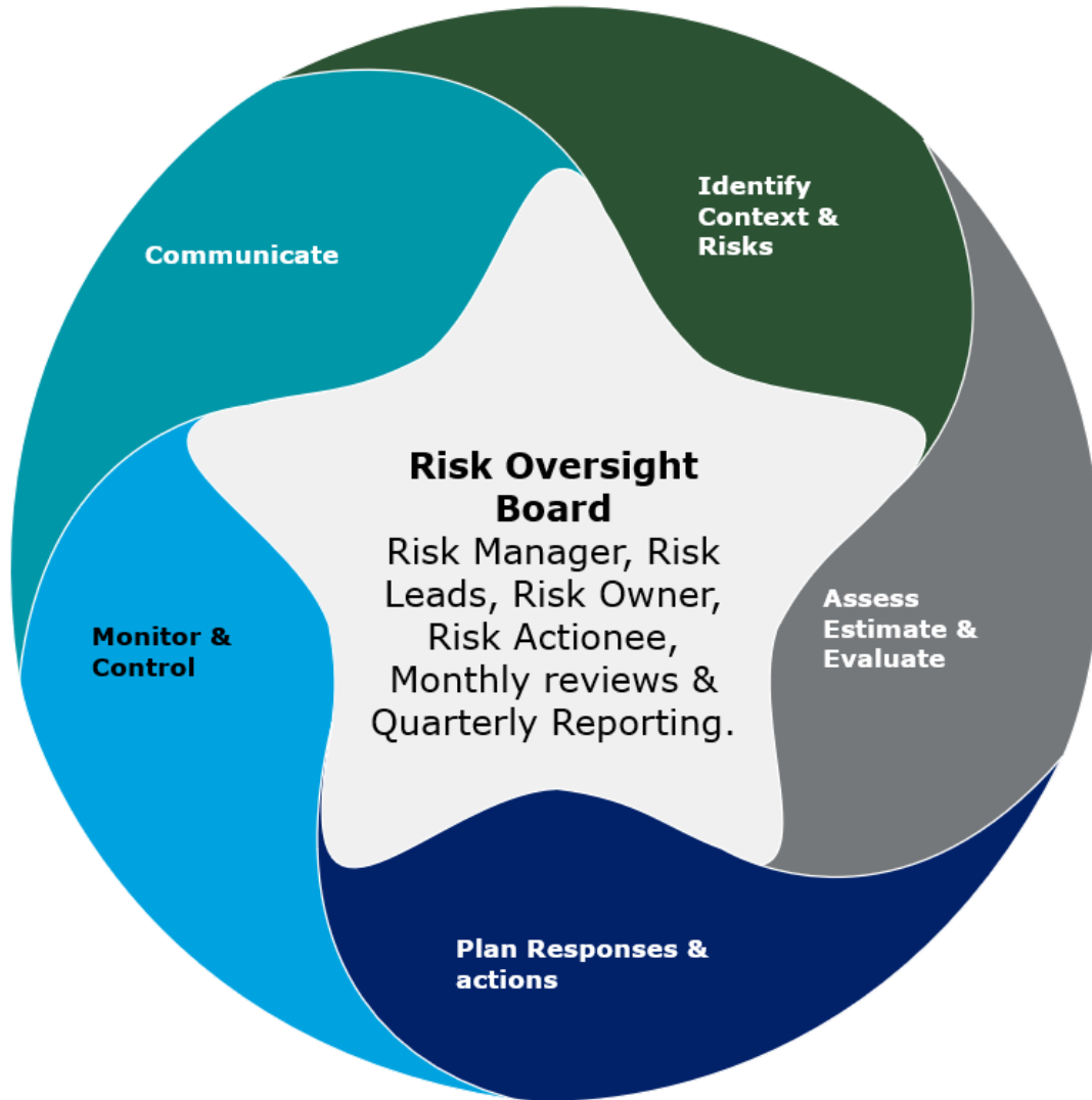
FIGURE 1: NOIRLab Risk Management Model.